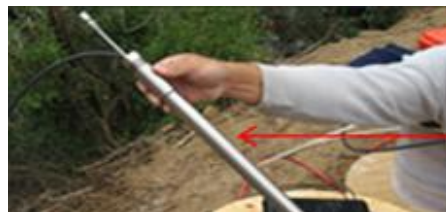
Figure 1 - Integrated transducer housing ready for deployment.